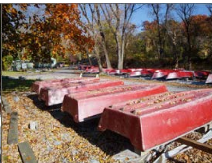
A crisp fall day at Fletcher's Cove