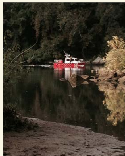
A D.C. fire boat cruises past Fletcher's Cove

Click here for a great interactive map of The Boathouse at Fletcher's Cove Area Fishing and Outdoor Fun (opens in new window)