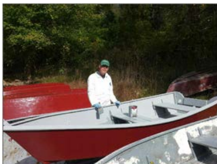
Prepping for the 2015 fishing season