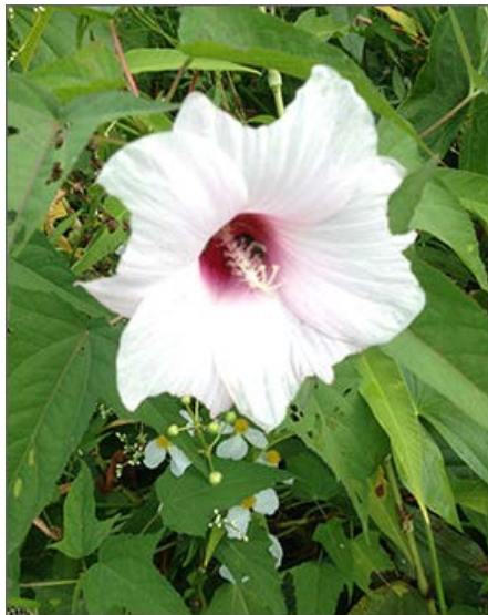
The delicate Rose of Sharon graces the marsh