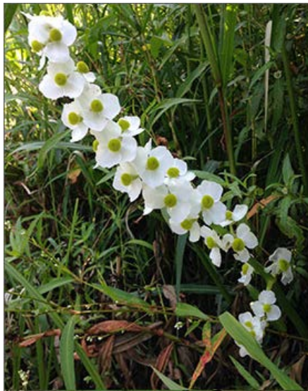
Arrowhead blossoms in the marsh