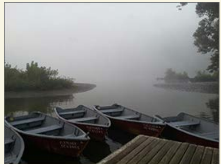
Cool Autumn air on warm water equals morning fog