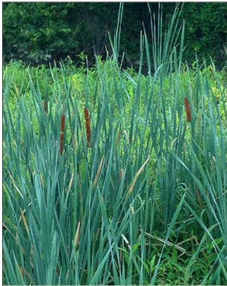
Cat Tails rise on Fletcher's marsh