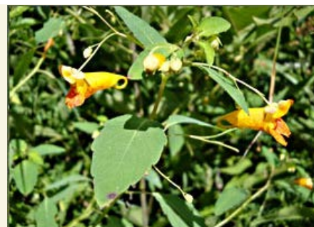
One of many delicate wildflowers on display at your local Fletcher's Cove

Home | Rentals/Rates | Fishing Report | Useful Links | Tackle Shack | Employment