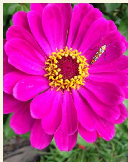
Ray's Zinnias in full glory right now!