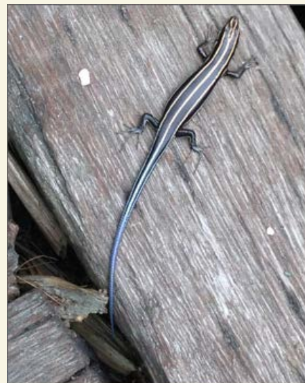
Blue tailed skinks fascinate the children at Fletcher's