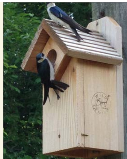
Swallows find a home at Fletcher's Cove