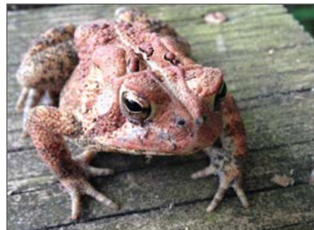
A toad finds a sunny spot at Fletcher's Cove