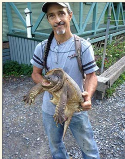
Snakehead King rescues an 18 pound snapper soon to be released to the canal