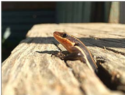
A skink pokes out at Fletcher's for some warmth from the sun"

The "full tilt" spring fishing season at Fletcher's Cove has now morphed into a more relaxed summer style. No more dawn rush to snag the best shad eddy or start the prime striper drift before anchored boats block the way. Hot weather fishing at Fletcher's is about opportunistic resourcefulness and the ability to switch gears between species. With the current of the Potomac gentler in the summer, a broad range of techniques should be employed to maximize angling success. Deep water trolling for walleyes may give way to dropping senkos over a prime smallmouth spot. Morning casting for schoolies with a bright Clouser could evolve into a rope-fly fest in pursuit of the elusive gar. The C&O Canal, flush with water, is tempting as a shady spot for bobber fishing or casting for