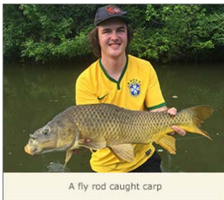
A fly rod caught carp

National Historic Park. One can only guess what would have happened to this land and shoreline without the protection the park provides. I've been blessed to get to know many C&O Canal NPS personnel - administrative, rangers and maintenance staff - whose dedicated service I admire and respect. Long before there even was a park to protect the land, Fletcher's hummed along as a beloved recreational fishing and boating mecca. The Fletcher family operated the business until 2005 when the concession was awarded to Guest Services, Inc. The history of the place is rich with interaction among people, place and business. As I sometimes remind visitors to the park, the canal itself was a business first and foremost, for most of its history. There were many homes, camps and businesses along the route of the canal and the B&O Railroad that often paralleled the path of the C&O. Most of those have disappeared into the mists of time, which makes Fletcher's, as a business, a rare and integral part of canal history itself.