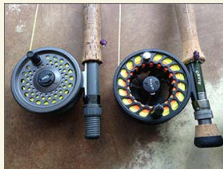
Fletcher's Cove has become a bit of a local fly fishing mecca. Note the unusual flies on the business-end of these outfits.