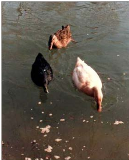
The "Killer Ducks" 1985

No pigeon sightings this year, however! In spite of our proximity to downtown, there are no tall building ledges upon which to nest or take refuge around here. I believe the hawks and eagles would make fast food out of a pigeon hanging around Fletcher's. One year, long ago, we had a visiting brown and white pigeon which we took "under our wing," so-to-speak, and it stayed most of the warm season. It vanished one day in late summer, hopefully having moved-on, but more likely, it became food for a hungry critter of some type.