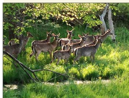
A herd of deer take an early A.M. pause near Fletcher's parking lot