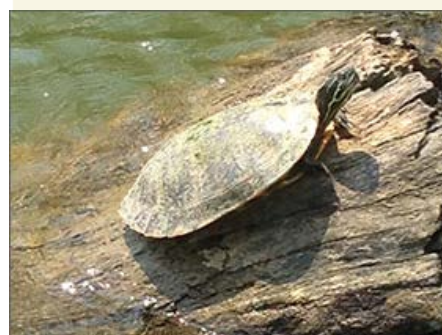
Need to slow your pace of life? Turtle-watching is a sport at Fletcher's Cove!