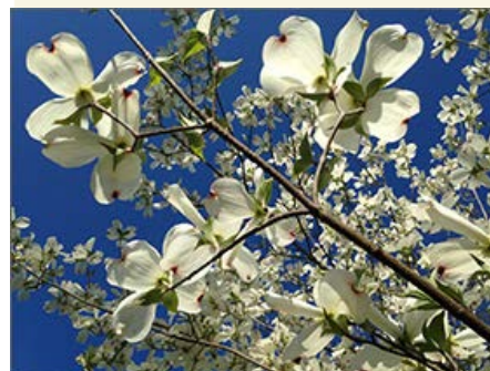
Dogwoods in bloom signal the heart of shad season