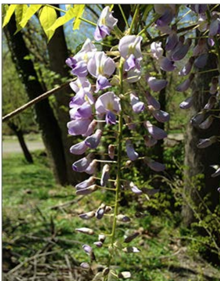
The delicate Wisteria sends a message... big perch are biting