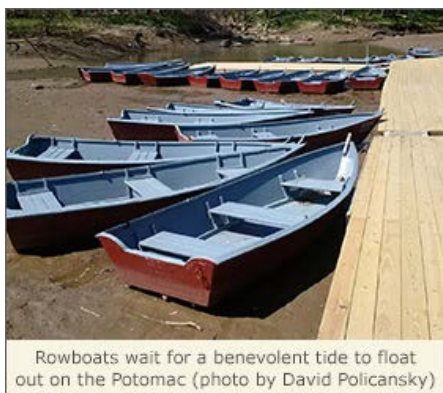
Rowboats wait for a benevolent tide to float out on the Potomac

Personally, I take pride in my advancing age.