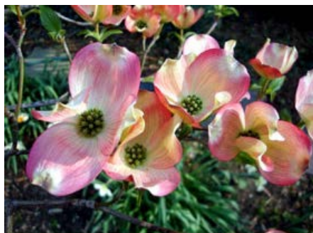
When the dogwoods bloom, shad are in the river!

be at least two more peaks to come. Not all the spawning fish arrive at the same time! It is wave after wave over a long period of weeks. This is nature's way of protecting the species from a short term calamity of environment or predation.