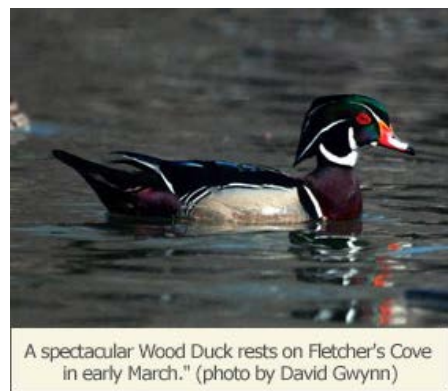
A spectacular Wood Duck rests on Fletcher's Cove in early March."