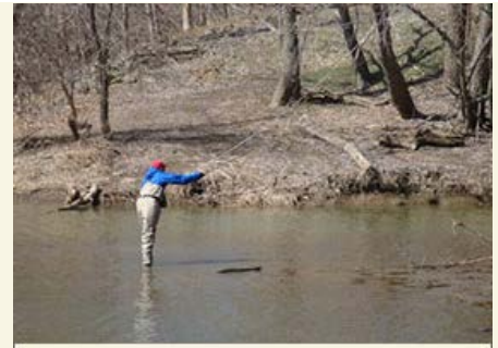
"Early season fly-fisherman, Fletcher's Cove"

Home | Rentals/Rates | Fishing Report | Useful Links | Tackle Shack | Employment About Us | Directions/Hours | Contact Us | More Recreation | Sitemap