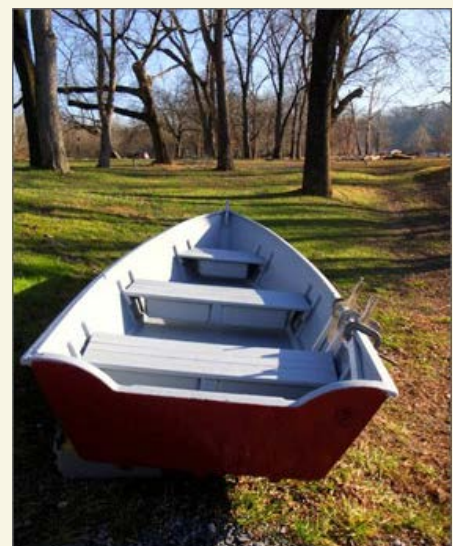
Waiting for spring along the Potomac

Click here for a great interactive map of the area around Fletcher's (opens in new window)