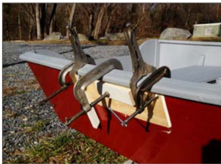
A bit of rot being repaired in early December

The calendar still indicates winter, but it is now meteorological spring in Washington. The "springtime snowflakes" that are falling around Washington today are destined to melt and re-charge the flow of the old Potomac. After virtually no snow this past winter, this is a good thing. I, personally, have an opinion, based more on spirituality than science, that the melting snow (more so than plain old rain) at this time of year sends a message to the perch, herring, shad and stripers that it is time to move upstream. Of course, numerous other elements are in play when it comes to the timing of the five different runs of anadromous fish of the Potomac, but no harm in holding onto a bit of mystery.