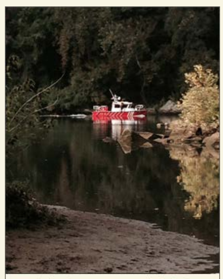
A D.C. fire boat cruises past Fletcher's Cove

Click here for a great interactive map of The Boathouse at Fletcher's Cove Area Fishing and Outdoor Fun (opens in new window)