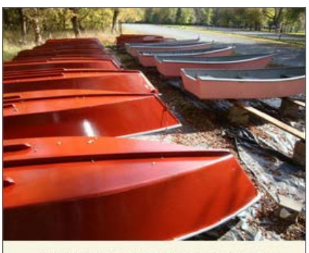
Rowboats Receiving Seasonal Repair

"To every thing there is a season..." A thought as old as the Bible (Ecclesiastes 3:1), and an appropriate feeling at this time of year for Fletcher's Cove. Sadly, our "season" has now come to an end. Each year, we are fortunate to wrap spring, summer and fall into one long string of smiles and miles along the Potomac and C&O Canal; but now, the kayaks and canoes are racked-up, the bikes are nestled neatly into their shed, and the classic rowboats are already being repaired and repainted.