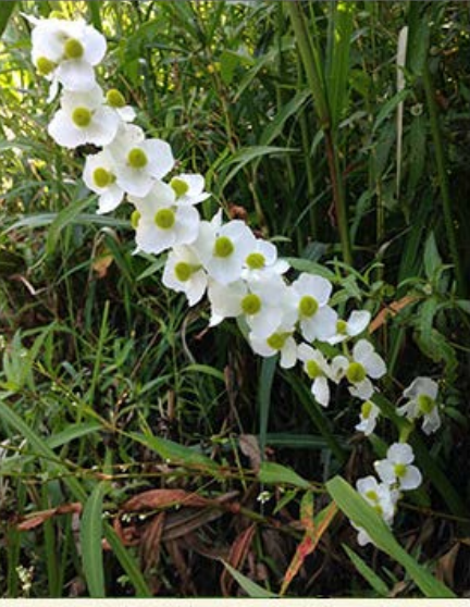
Arrowhead blossoms in the marsh