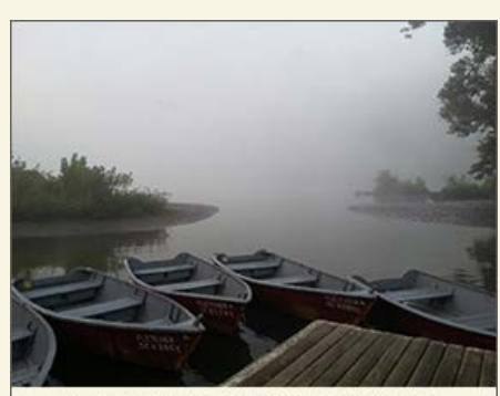
Cool Autumn air on warm water equals morning fog