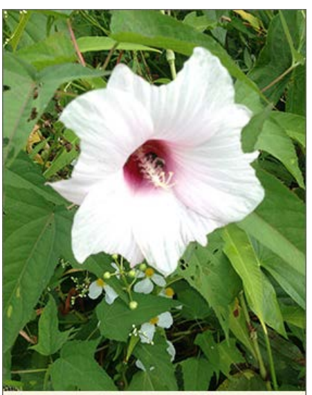
The delicate Rose of Sharon graces the marsh