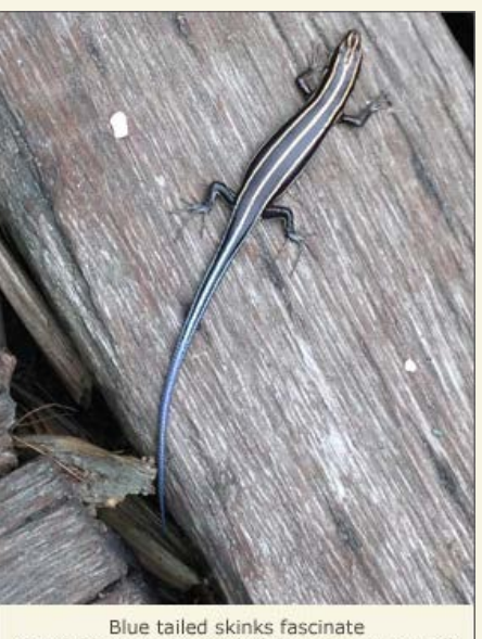
the children at Fletcher's