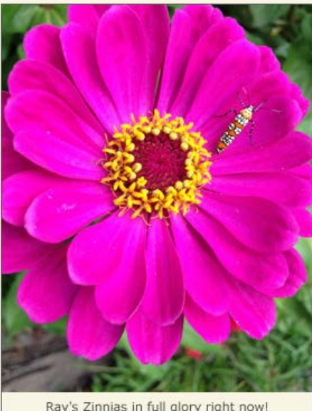
Ray's Zinnias in full glory right now!