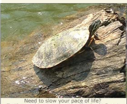
Need to slow your pace of life? Turtle-watching is a sport at Fletcher's Cove!