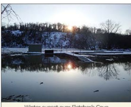
Winter sunset over Fletcher's Cove

There's lots to do prior to welcoming new and old friends: final boat prep and registration, oars to paint, cleanup of the facilities, bait and tackle to order, D.C. fishing permits to purchase and the assorted administrative and office system details that can't be ignored, even at a place that shouts for simpler times. One thing you can count on at Fletcher's Cove is a smile and the feeling that you've left the hustle and bustle behind for the day. Here at this very special spot along the Potomac, nature speaks with a voice that is impossible to ignore.