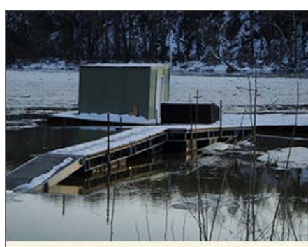
New Dock Elements on a Thawing Riverscape

In my lifetime as a Washingtonian I have never seen the Potomac so solidly and deeply iced-over as it has been of late. Those of us along the Potomac now hope for a gentle thaw, one that minimizes the dangers of an ice jam that can crush docks and boats like a vise. The landscape at Fletcher's Cove has been a frozen tundra since early January. It is amazing to think that in a few short weeks, fish from distant waters will school urgently