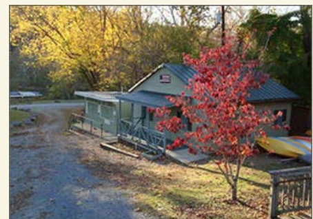
A blaze of fall color surrounds the tackle shack and bike shed